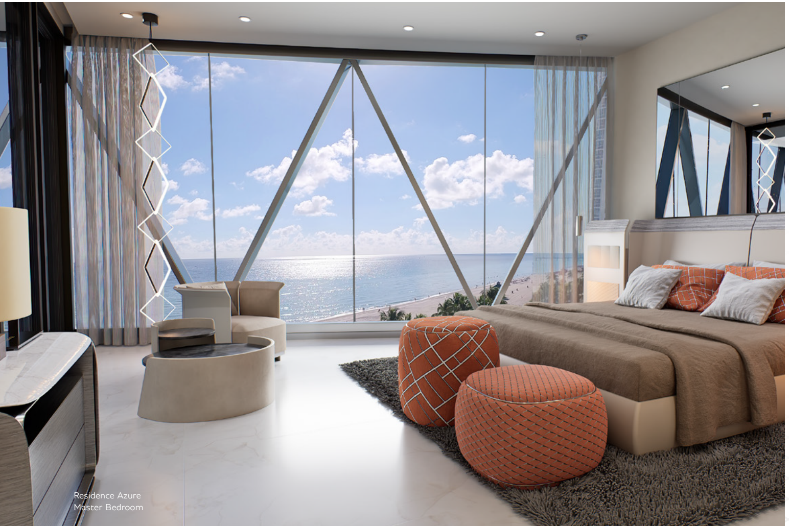
Residence Azure Master Bedroom